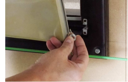
Place rings on both sides of the new flap.