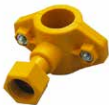
Clamp 4378-00 / 4379-00

The combination of LUBING plastic shut-off valve art. 3325-00 with clamp art. 4378-00 for pipes Ø 25mm or clamp art. 4379-00 for pipes Ø 26.7mm ensures a fast and safe connection to the water line.