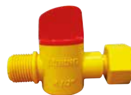
Shut-off valve 3325-00